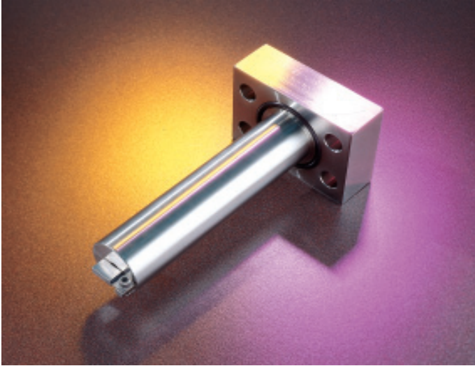
The model SPC/L392 flanged sensor has a rugged design that helps it tackle any operating environment.

FOR VISCOSITY MEASUREMENTS FROM 0.2 to 20,000 CENTIPOISE